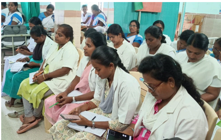
Health officials participating in the meeting.