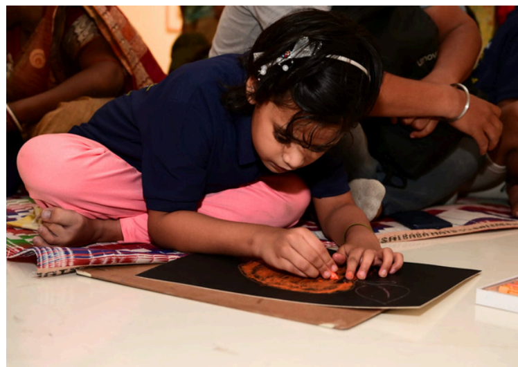
A child painting with mentor's guidance.