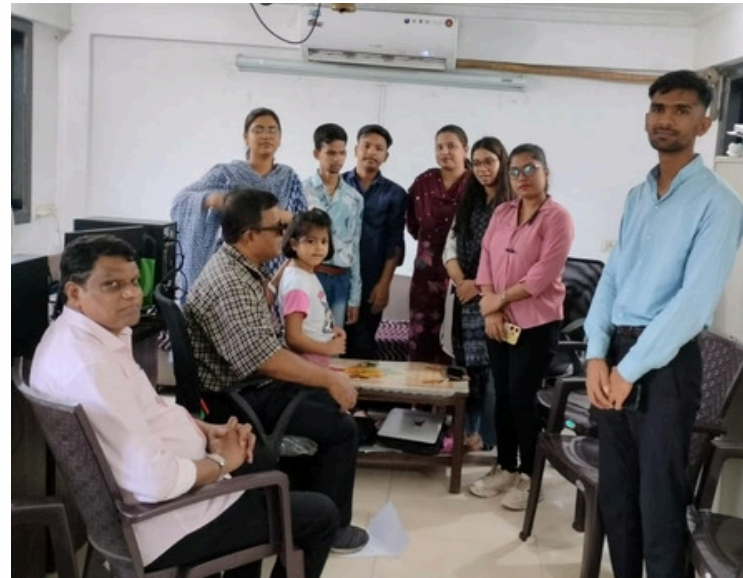
Team Ek Kadam Aur at Sahayogini Palak Sanstha.

Community Outreach: On May 11, 2024, Ek Kadam Aur Foundation was invited to present our program to the Venus Club in Mumbai. This opportunity allowed us to raise awareness about our work and potentially expand our network of supporters in the region