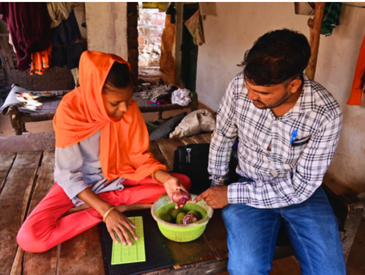
Children receiving training to identify vegetables.