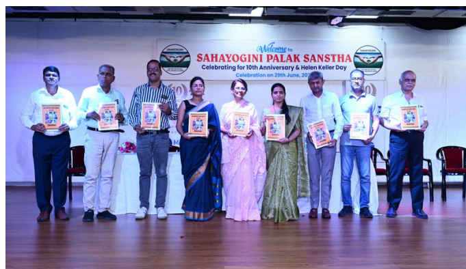
Team Ek Kadam Aur with Sahayogini Palak Sanstha.

Anniversary and Celebration Event: The Ek Kadam Aur team was invited to the 10th Anniversary and Helen Keller Day celebrations at Sahayogini Palak Sanstha in Navi Mumbai. Children from Arunodaya actively participated in singing and dancing programs, showcasing their talents and adding to the event's success.