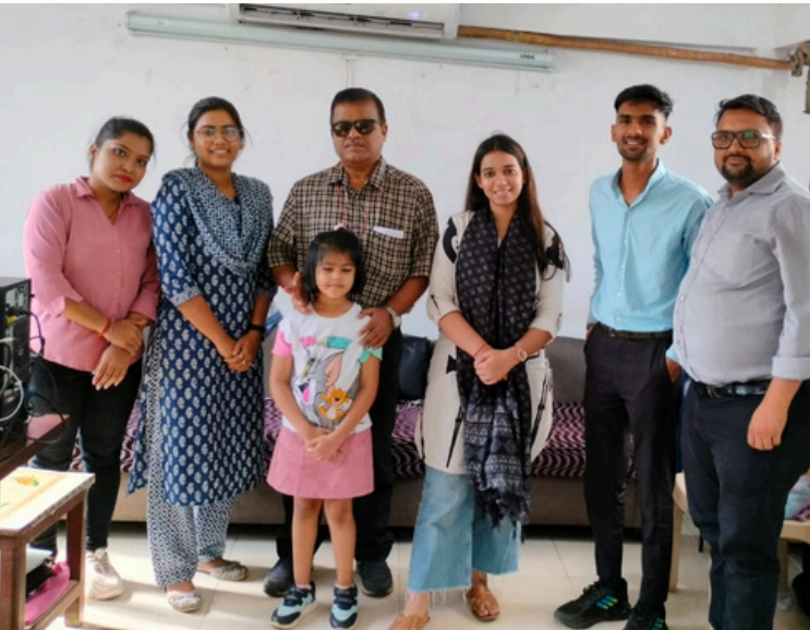
Team Ek Kadam Aur at Sahayogini Palak Sanstha.