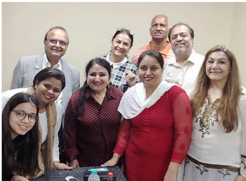
Team Ek Kadam Aur with members of Venus Club.

Community Outreach: On May 11, 2024, Ek Kadam Aur Foundation was invited to present our program to the Venus Club in Mumbai. This opportunity allowed us to raise awareness about our work and potentially expand our network of supporters in the region