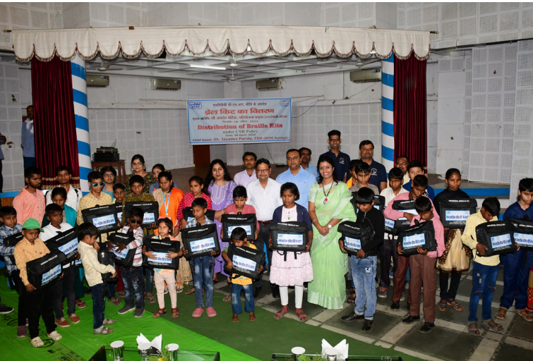
Children of Arunodaya with Braille kits.

Corporate Collaboration for Literacy: 28 of our children, accompanied by their parents and special educators, participated in a Corporate Social Responsibility (CSR) initiative organized by the National Thermal Power Corporation (NTPC). This collaboration resulted in the distribution of 40 Braille Kits, providing essential tools for our students' education and independence.