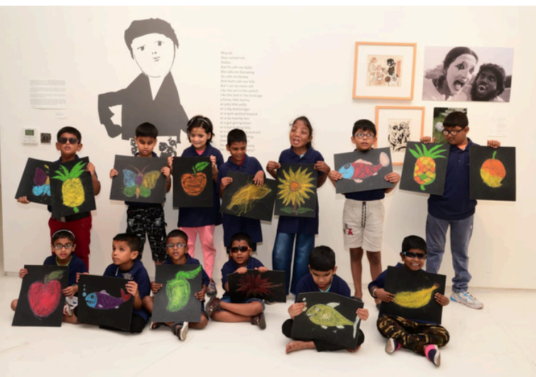
Children with their paintings at Kolkata Creativity Centre.

Celebrating Creativity: On World Creativity and Innovation Day, 15 of our children participated in an event organized by the Kolkata Creativity Centre. With support from their mentors and our team members, these young artists created beautiful paintings, showcasing their talents and challenging perceptions.